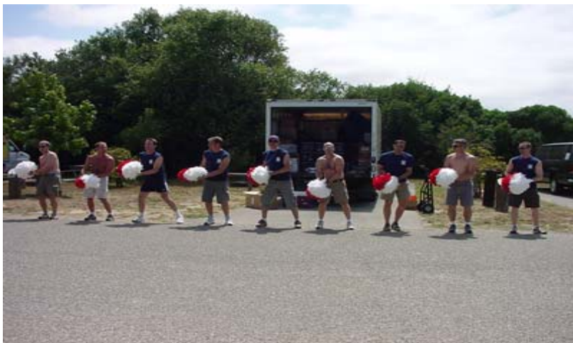
With no Rest Stop 4 on Day 5, the guys still got into the spirit, welcoming cyclists back to Camp.