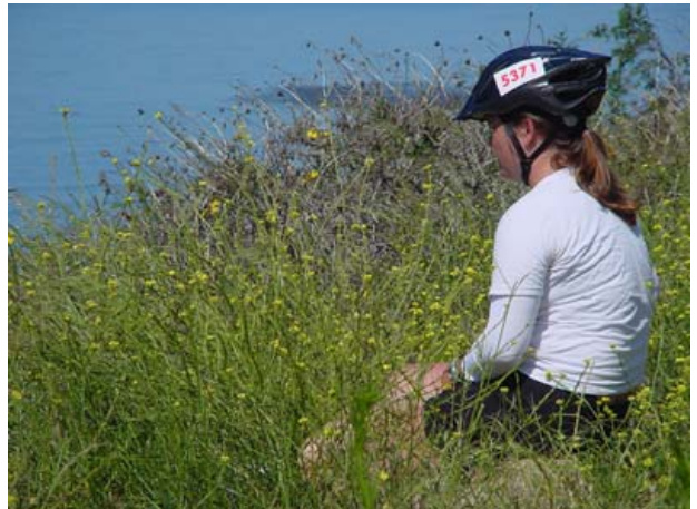
A moment for contemplation on Day 6

At rest stops, while basking in the sun and glimpsing